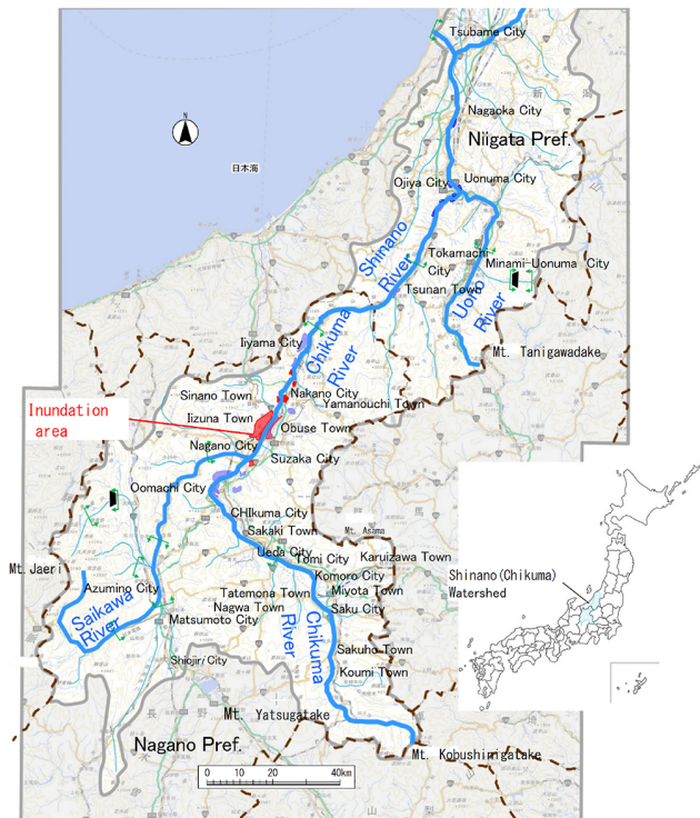
Figure 2. Map of Chikuma and Shinano River basin based on the map from Ministry of Land, Infrastructure, Transport and Tourism Japan.

on evacuation of residents and road closures. Conduct monitoring of the damaged area. Planning of emergency countermeasures, which must be done urgently and quickly so as not to delay the emergency countermeasure work. In recent years, survey use new technologies such as UAVs. In case of a large-scale disaster, aerial surveying is conducted to confirm safety during lifesaving operations.