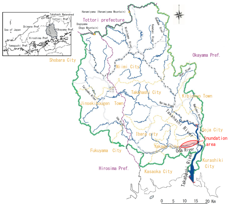
Figure 1. Map of Takahashi and Oda River basin based on the map of Ministry of Land, Infrastructure, Transport and Tourism Japan.

was assessed through on-site inspections, and runoff analysis, water level calculations, inundation analysis, etc. were conducted and the proposed improvement menus were presented to procurers.